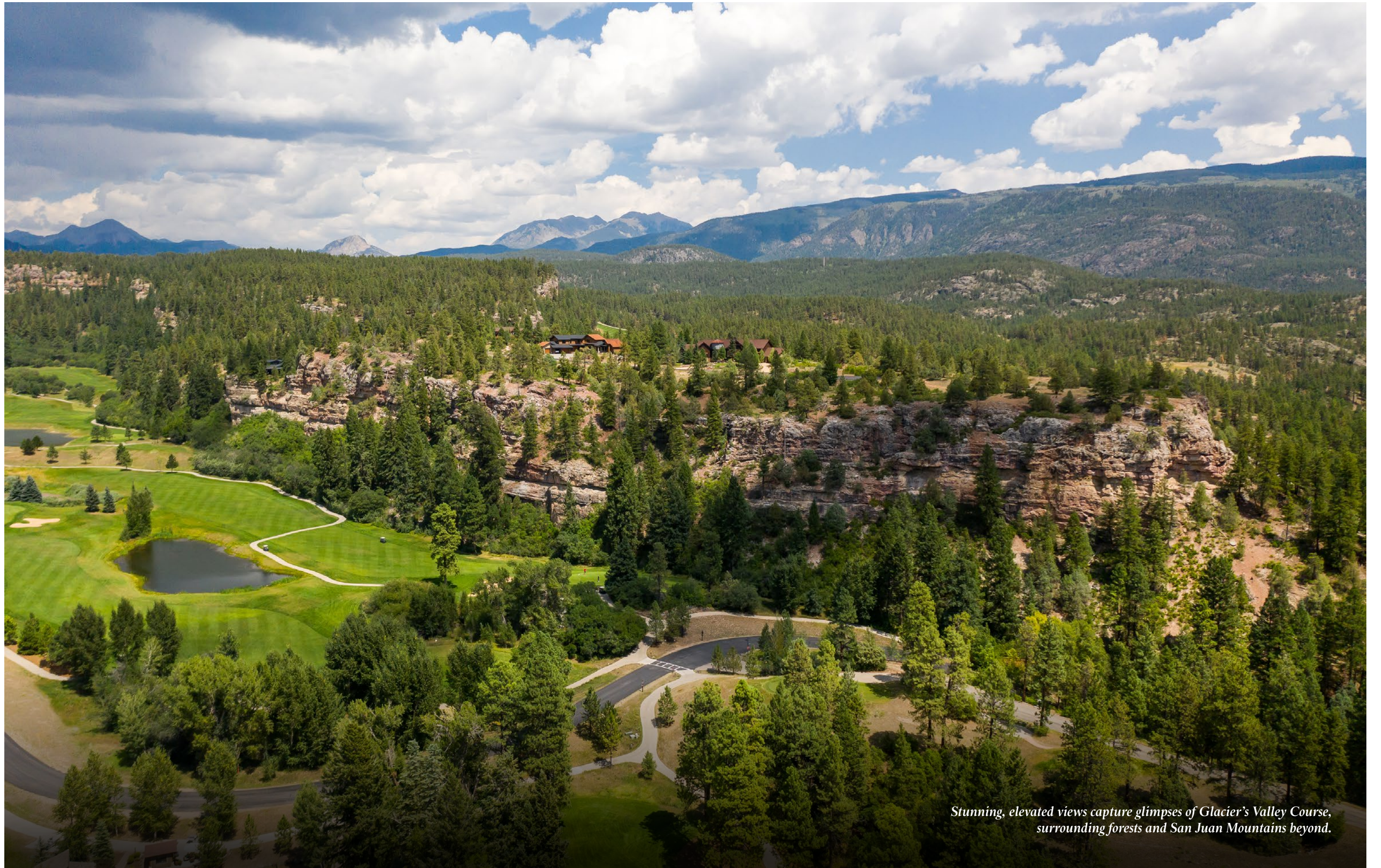
Stunning, elevated views capture glimpses of Glacier's Valley Course, surrounding forests and San Juan Mountains beyond.